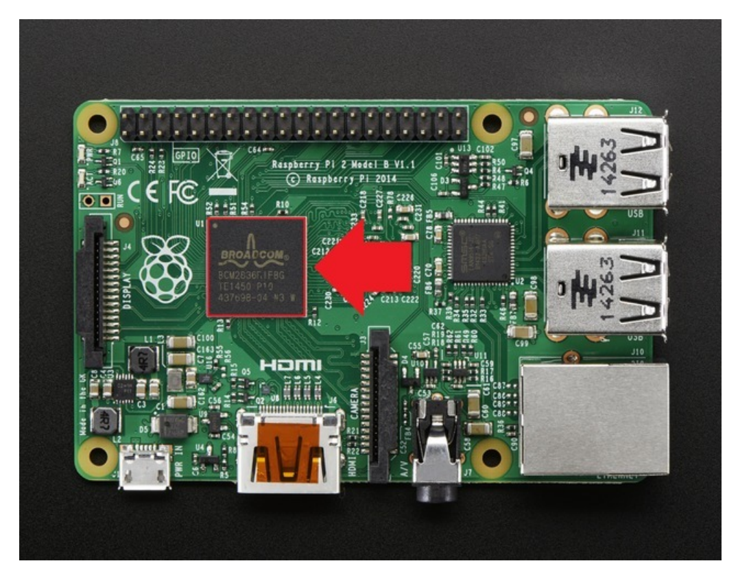
If you don't see the logo, or you see something like "Samsung" or "Hynix" it's a B+