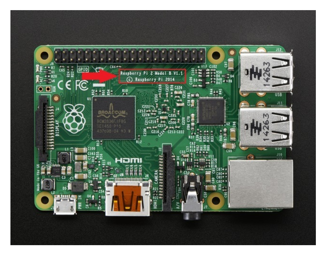
Look for the "Raspberry Pi 2" text and you're golden!

First up, you can look for the name which is near the GPIO connector: