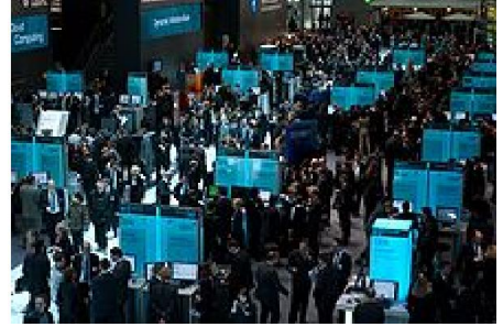
IBM stand during CeBIT 2010 Jimmy Wales 2014 on CeBIT Global Conferences, Wikipedia Zero

A crowded exhibition hall during CeBIT 2000