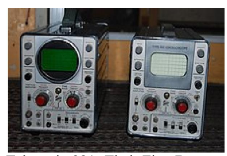
Tektronix 321- Their First Battery Operated Transistor Oscilloscope. LEFT- Later Version RIGHT- Earliest Version

In 1956, a large piece of property in nearby <u>Beaverton</u> became available, and the company's employee retirement trust purchased the land and leased it back to the company. Construction began in 1957 and on May 1, 1959 Tektronix moved into its new Beaverton headquarters campus, on a 313-acre (1.27 km²) site which came to be called the Tektronix Industrial Park.