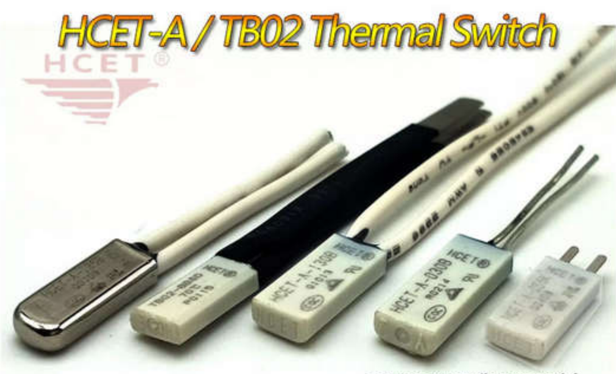
contactor use silver material